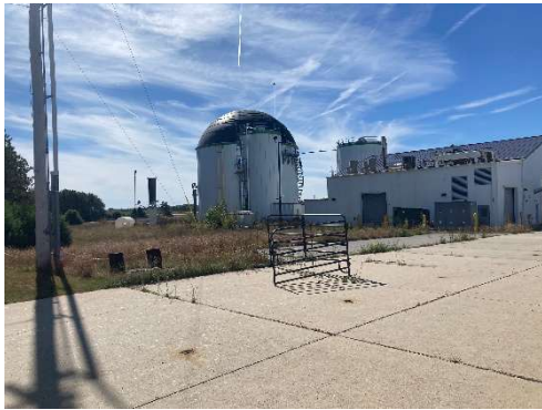
Anarobic Renewable Energy Plant

On your own you may view the vintage naval airplanes as you enter Brunswick Landing, the old Brunswick Naval Air Station, A vintage P2 and a P3 Naval airplane from the 1950's have been restored.