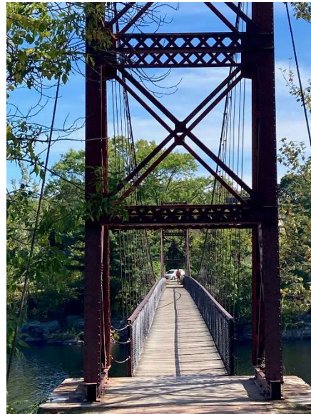
Old Androscoggin Bridge