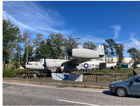
P2 or P3 Navy Plane

9:30-9:45 Meet in parking lot at TechPlace, 74 Orion Street, also in Brunswick Landing. We can use their bathrooms upon arrival.