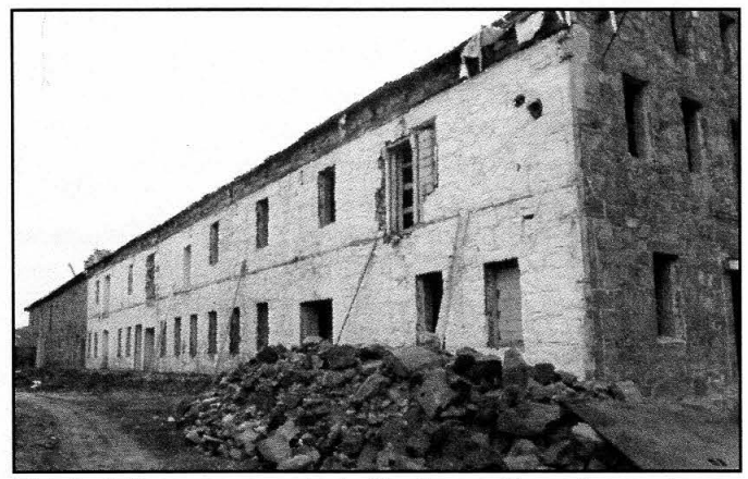
This building was once the boiler house. Extensive work was being done both inside and outside the buildings.

The tour next walked to the mansion of Oliver Ames, Jr. This house is an example of a Victorian era structure with Italian Renaissance architectural style. Behind and beside it were beautifully landscaped lawns. On the other side of the street