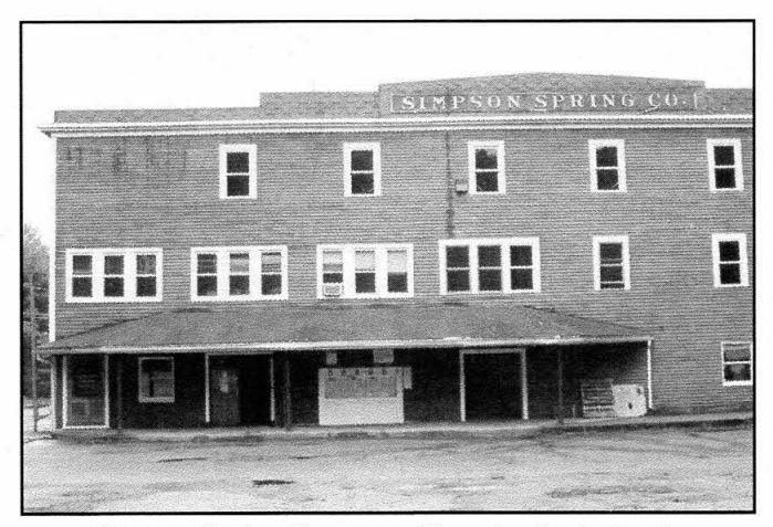
Simpson Spring Company.

1878 and claims to be the oldest bottler in the country. They are still bottling at their original spring south of Washington and Depot Streets. In addition to spring water, they make several flavors of soda.